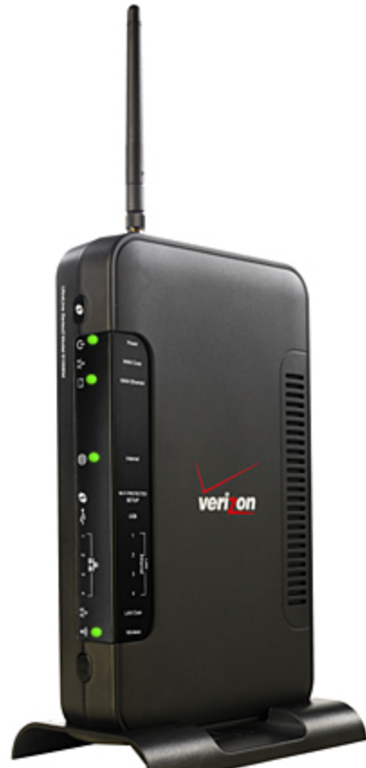
Diagnostic LEDs on Verizon 9100EM Router